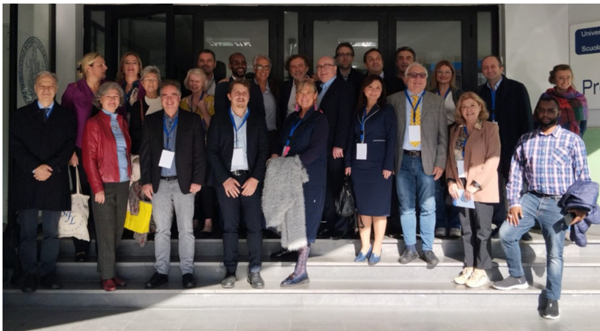
RSCN 2023 General Assembly. Naples 13/11/2023. AHL Reference Site Representatives, E.C